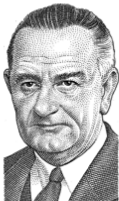
Lyndon B. Johnson

Overall defense spending today is higher than it was during Vietnam, when adjusted for inflation, but is just about 4% of GDP. That's an increase from when Mr. Bush took office, but far from the Vietnam peak of 9.5% of GDP in 1968, and less even than the 1980s Cold War buildup. Even with the planned troop surge, the U.S. will have about 160,000 troops in Iraq, well below the 550,000 Vietnam peak.