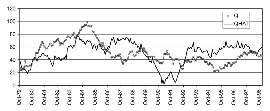
Fig. 2. Actual (q) and Model-Based ( \hat{q}_t ) Real Exchange Rates (Notes: \hat{q} is the fitted value of the real exchange rate from the baseline specification presented in Table 1, scaled to have the same mean and standard deviation as the actual real exchange rate q.)

of Section 1 above.) That we did not have data to directly account for the effects of such shocks might therefore partly explain the negative correlation between \hat{q}_t and \pi_t and the far too negative correlation between \hat{q}_t and y_t .